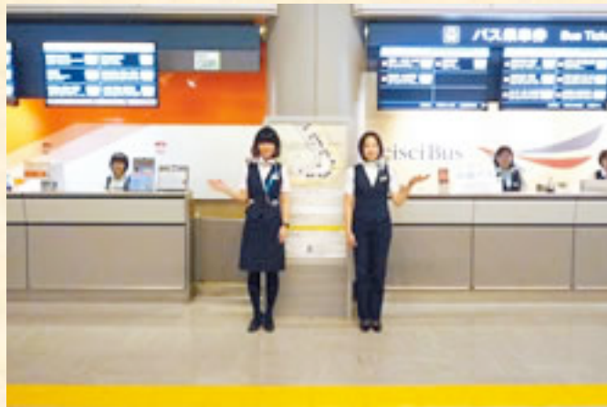
Bus-ticket counter at the airport.

http://rso.kek.jp/eng/Access/Narita.html